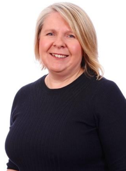
is located at: Ladybirds