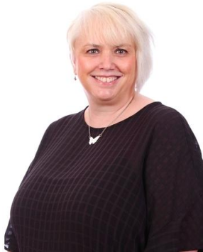
is located at: Ladybirds